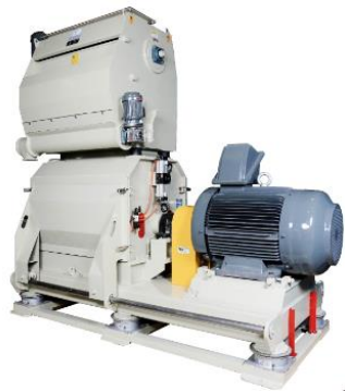
HMA hammer mill produced by Idah Co.