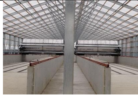
Fermented chicken manure processing system developed by Sunki Biotech.