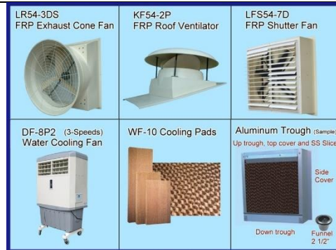
Kolowa Ventilations and cooling system

For exhibitor and media inquiry, please contact